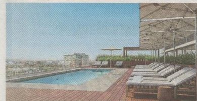
Lap of luxury: Chill like a pro on top of the James Hotel, West Hollywood

Try the signature Isabel cocktail with vodka, strawberries, honey and pepper.