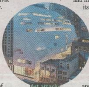
Art attacks San Fran's MOMA

from £164, highlandranchresort.com). Until just a few weeks ago, when this collection of luxurious cottages surrounded by mountains and meadows welcomed its first guests, accommodation in this protected wilderness of volcanoes and rare flowers was limited to unheated cabins.