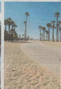
Got to lava hotspot: Lassen Volcanic National Park and, above, Pacific Beach in Santa Monica

from £164, highlandranchresort.com). Until just a few weeks ago, when this collection of luxurious cottages surrounded by mountains and meadows welcomed its first guests, accommodation in this protected wilderness of volcanoes and rare flowers was limited to unheated cabins.