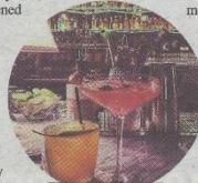
Cocktail time: Hang out at the hip Ysabel

Beyond the city, 45 miles to the north, is Sonoma, a wine-producing region that rivals Napa. And Sonoma is slowly becoming known for its food as well. Already home to three