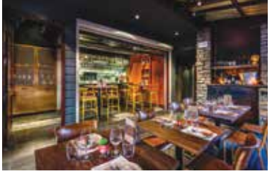
Moruno at the Farmers Market